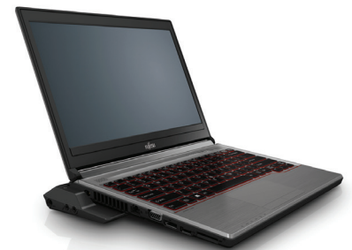
Shown with optional Port Replicator